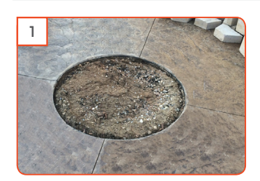
STEP 1 - Excavate your location for a drainstone base and fill excavated area with drain stone, level & compact.